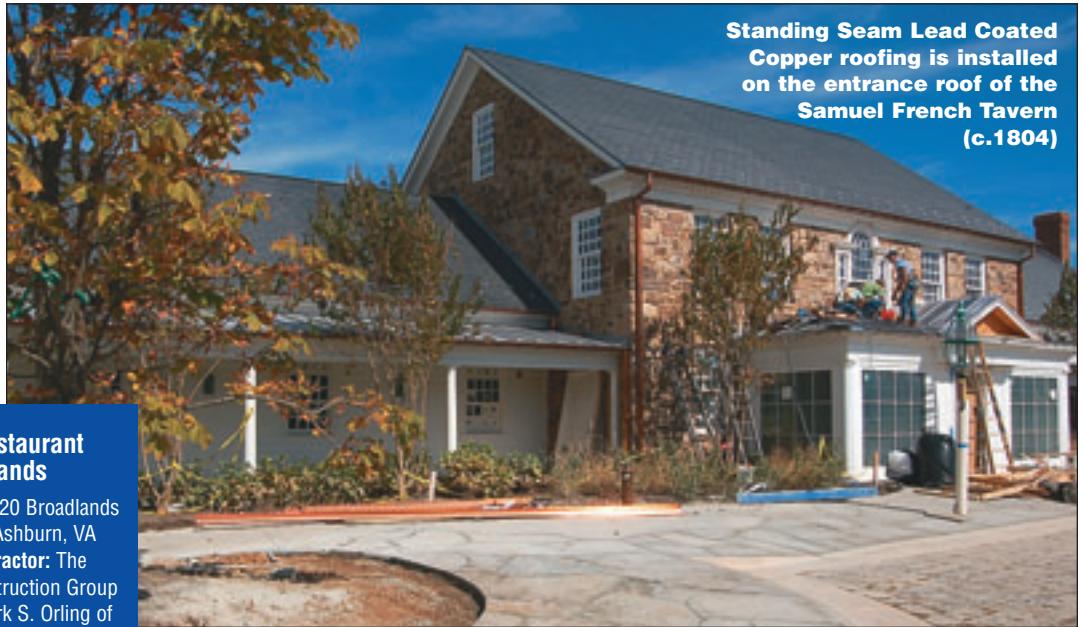
Standing Seam Lead Coated Copper roofing is installed on the entrance roof of the Samuel French Tavern (c.1804)

The concept of building from historic pieces began for Clyde’s in the early 1980s, when the company purchased several antique heavy timber structures: the Chandler Barn (c.1885), the Samuel French Tavern (c.1804), the Roxbury House (c.1810) and the Richmond House (c. 1780). They worked with Vermont-based Weather Hill Restoration,