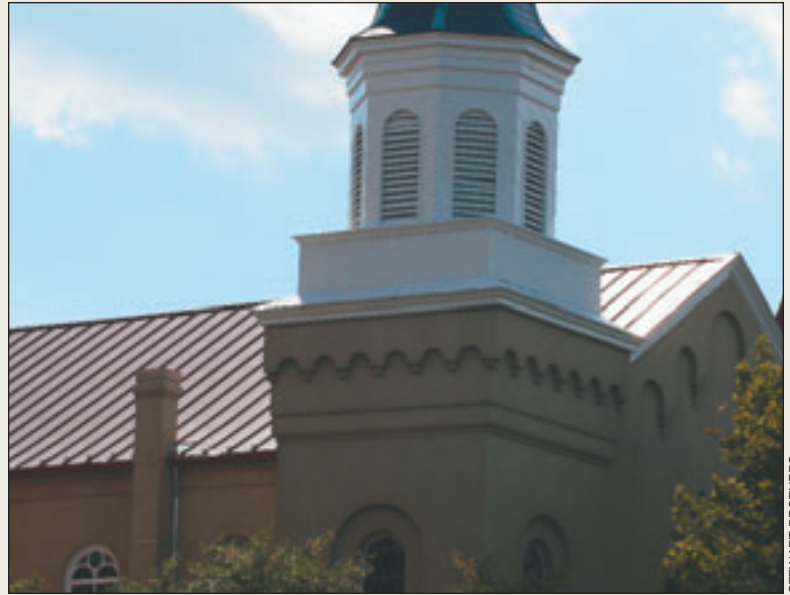
Downtown Baptist Church , 212 S. Washington Street, Alexandria, VA. Originally built in 1803, the steeple was added in 1858. New Buckingham slate and copper hip metal. Base of steeple restored and painted.