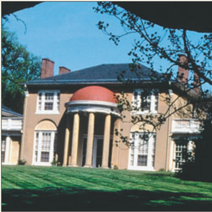
Tudor Place , 1644 31st Street NW. New lead-coated copper roofs, copper gutters and downspouts.